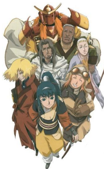
"Samurai 7" key visual ©2004 AKIRA KUROSAWA /SHINOBU HASHIMOTO /HIDEO OGUNI/NEP・GONZO

(4) Event Navigator: Noriko Namiki (voice actress)