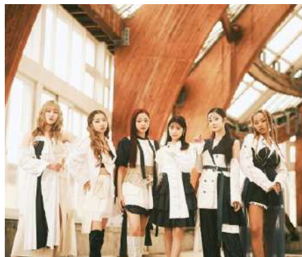
Little Glee Monster