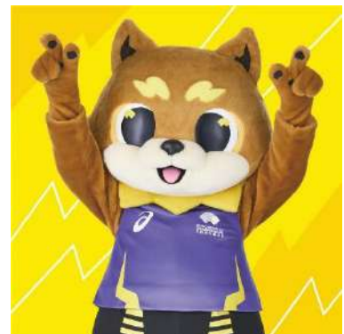
Riku One (Mascot of WCH Tokyo 25)

Date/Time: September 13 (Sat.) thru 21 (Sun.), 2025