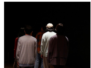
"Autumn north wind" (2023) ©Saori Saito

Dates: Fri., Oct. 31 - Mon., Nov. 3, 2025