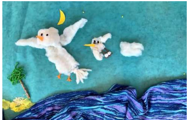
Photos from previous anime production workshops