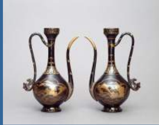
Pair of Ewers with Landscapes Japan, Edo period, 18th century Kyoto National Museum

For over two millennia, Japan has engaged with various cultures around the world, and these encounters have been vividly reflected in the country’s art. The special exhibition “ Japan, an Artistic Melting Pot ” offers a fresh perspective on the history of Japanese art through the lens of international cultural exchange. Held at the Kyoto National Museum, just a 25-minute walk from Kyoto Station, the exhibition features approximately 200 works—including 18 National Treasures—encompassing paintings, sculptures, calligraphy, works of decorative and applied art from ancient times to the modern era. Highlights include iconic masterpieces such as the woodblock print “Under the Wave off Kanagawa,” also known as “The Great Wave,” from the series “ Thirty-six Views of Mount Fuji ” by Katsushika Hokusai, and Tawaraya Sōtatsu’s golden National Treasure screens “ Wind God and Thunder God ”. These artworks trace how Japanese culture has been shaped by encounters with different cultures across thousands of years of history. Timed to coincide with Expo 2025 Osaka, Kansai—a global celebration of cultural exchange—this exhibition offers a unique opportunity to explore the rich relationship between Japanese art and the world. JAPAN, an Artistic Melting Pot