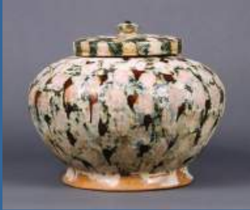
Important Cultural Property, Funerary Jar Excavated from Nagoso Tomb, Hashimoto, Wakayama Japan, Nara period, 8th century, Kyoto National Museum