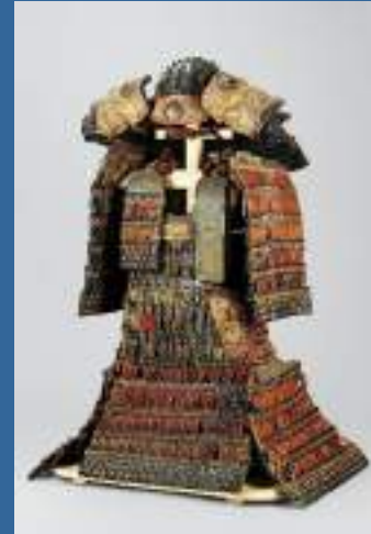
National Treasure: Red “yoroi” armor with “kawaodoshi” (plates bound together with leather laces). Heian Period, 12th century / Collection of the Okayama Prefectural Museum. Display period: May 20 – June 15.

Celebrate Japanese heritage at the Osaka City Museum of Fine Arts with the Special Exhibition: National Treasures of JAPAN. From April 26 to June 15, this remarkable event marks the Osaka-Kansai Expo and the grand reopening of the museum following a two-and-a-half-year-long renovation. Featuring approximately 130 National Treasures, the exhibition provides a rare chance to explore the pinnacle of Japanese art and craftsmanship. Visitors will be captivated by the exhibit’s six major themes, including the “Masters of Japanese Art” section, featuring works by renowned Japanese artists of the past, and “The Splendor of Ancient Japan” section, which explores ancient Japanese culture through art pieces such as dogū clay figurines, dyed textiles, and more. Visitors with reservations get priority entrance on weekends and holidays, so it is recommended to make a prior reservation.