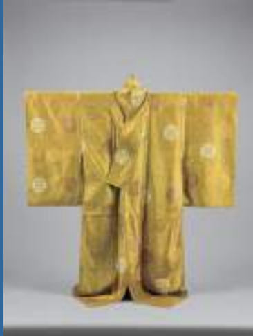
National Treasure: “Akome” (a layer of clothing worn by nobles between the “shitagasane” underkimono and “hitoe” robe), featuring a light green pattern of small hollyhock leaves and round crests, woven in double-layered twill (part of the ancient Shinto treasures). Nanbokucho Period, Meitoku 1 (1390) / Stored at Kumano Hayatama Taisha Shrine, Wakayama. Image provided by Wakayama Prefectural Museum / Display period: May 27 – June 15.