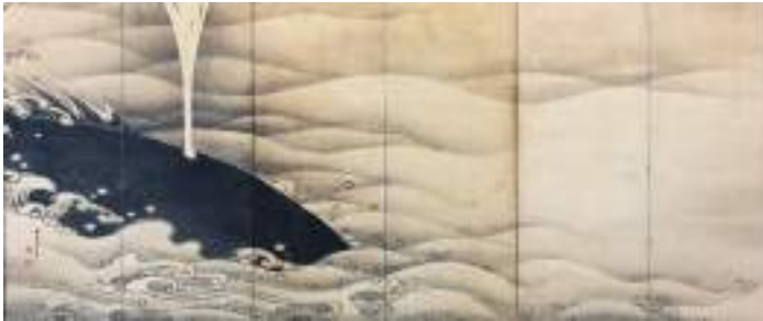
ITO Jakuchu, Elephant and Whale, left screen, 1795 (Kansei 7) ink on paper; pair of six-fold screens, MIHO MUSUEM