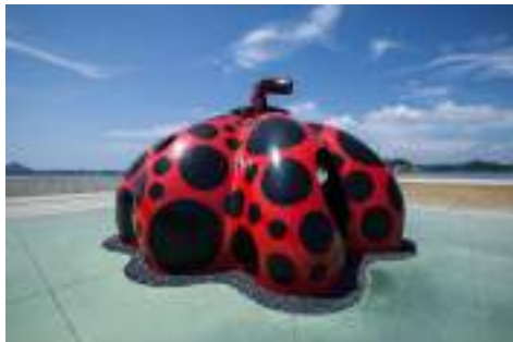
"Red Pumpkin" Yayoi Kusama, 2006 Naoshima Miyanoura Port Square, Photo/Daisuke Aochi ©YAYOI KUSAMA

(Reproduction of this image is strictly prohibited.)