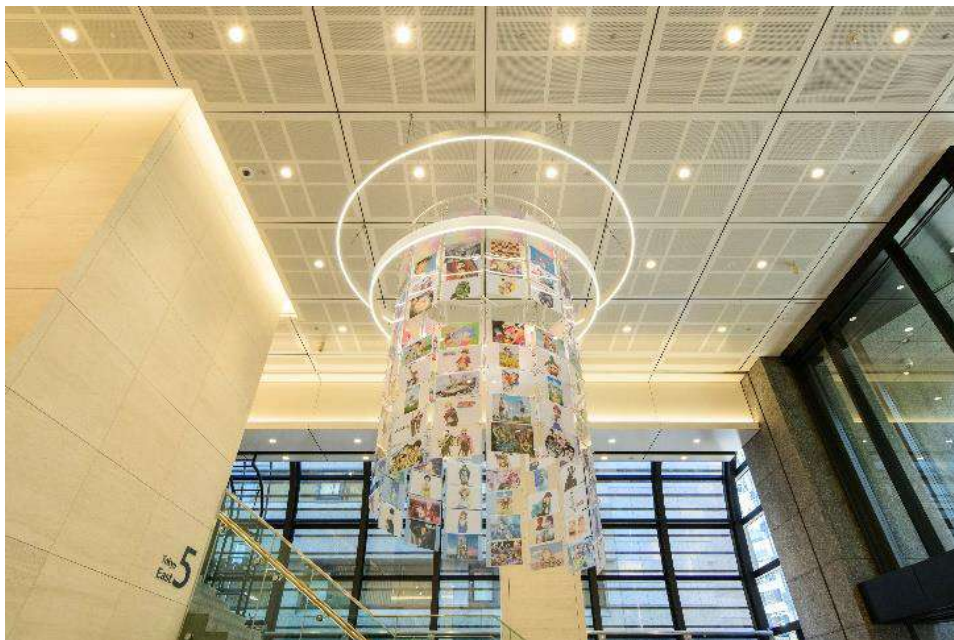
Symbolic artistic installation on the 1st floor of Anime

Please visit Anime Tokyo Station and indulge yourself in the allure of anime.