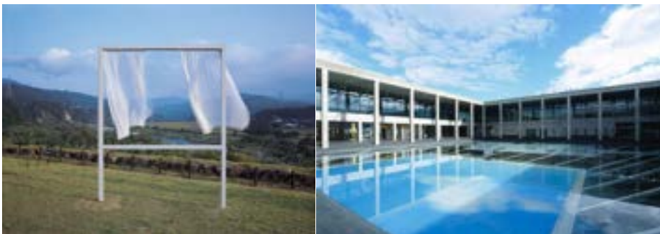
©"For Lots of Lost Windows" Utsumi Akiko