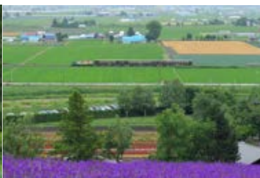
Furano Biei Norokko Train