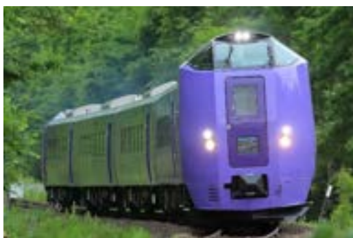
Furano Lavender Express