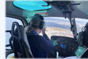
Osaka, Kansai Expo venue in construction from a helicopter

While considering the needs of the foreign press and the necessity of disseminating information from Japan, the FPCJ helps with reporting and provides information for foreign correspondents in Japan and members of the foreign press visiting Japan. Important topics such as population decline, the aging population, the security environment surrounding Japan, and the handling of the ALPS treated water from Fukushima Daiichi Nuclear Power Station were covered from a variety of angles in press briefings, press tours, and the fellowship program.