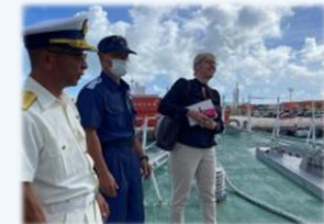
Journalists reporting on the ground on fellowship program

With countries around the world facing shared issues such as climate change and declining birthrates with aging populations, there is global attention on Japanese initiatives to deal with those issues before other countries. As the growing number of inbound tourists demonstrates, there is also high interest in Japan as a destination for travel. The FPCJ will continue to work so that the world can learn about Japan's attractions and strengths through the foreign media.