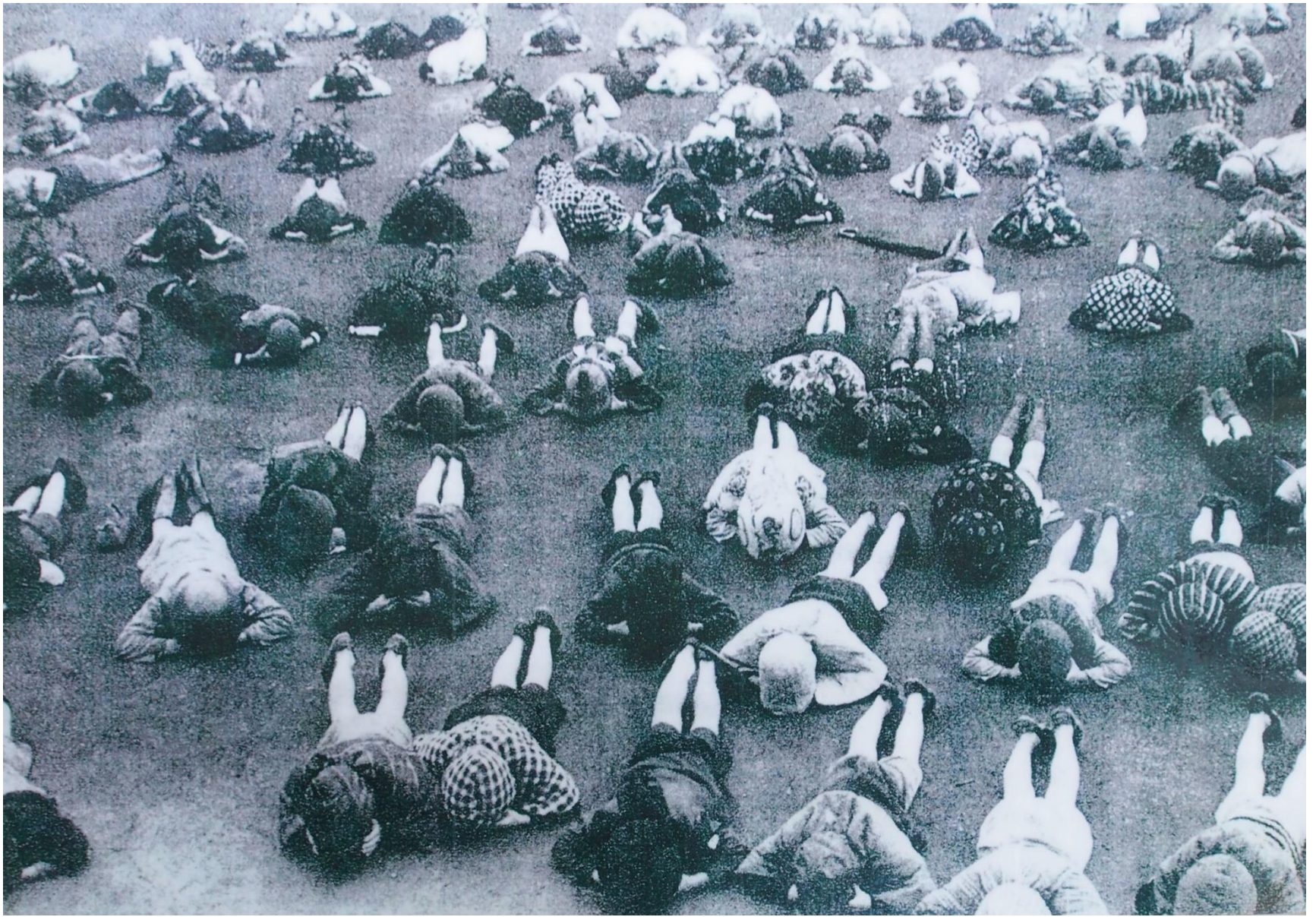
Students training for air-raids