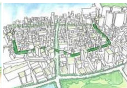
Tokyo will have a new green network.