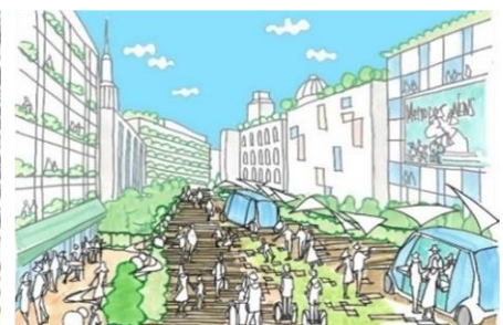
This public space will become a center for enjoyment and activity.