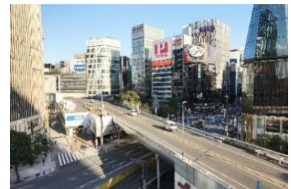
Present-day KK Line

This two-kilometer stretch from Shimbashi to Kyobashi has played many roles over the years, always acting as a form of social infrastructure and supporting the needs of the people and the local economy. Until the early 20 th century it served as a transit way for boats, while in the postwar era it supported road traffic. In the Tokyo of the 21 st century, it will become a green link connecting several of the city’s districts.