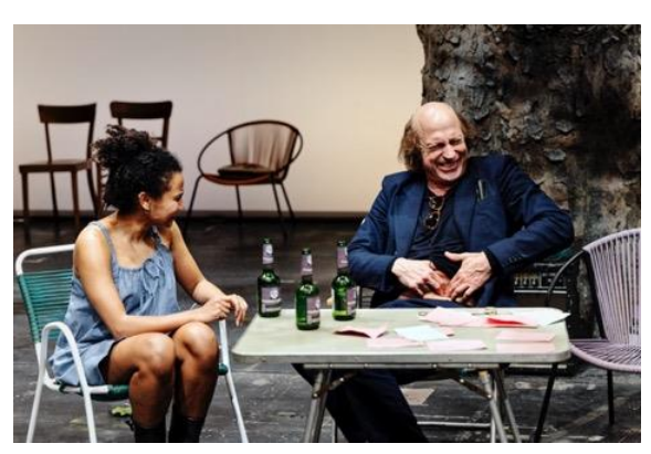
The Seagull / Production: Schaubühne