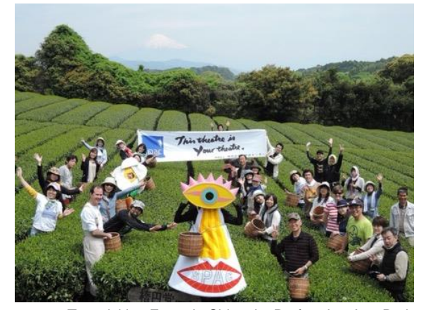
Tea-picking Event in Shizuoka Performing Arts Park