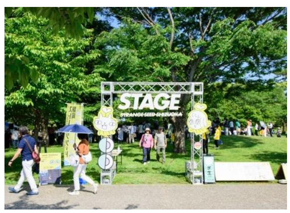
STRANGE SEED in Sumpu Castle Park