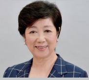
Governor of Tokyo Yuriko Koike