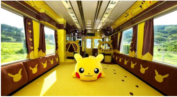
©2023 Pokémon. ©1995-2023 Nintendo/Creatures Inc. /GAME FREAK inc.

The train itself is unlike anything you've ever seen before, with Pokachus waiting around every corner. Reserve your place to sit with Pikachu in the car up front, or take a step back to the Playroom Car where kids can try their hand at being the conductor in the driver's cab or engine room. The Playroom Car features a reclining Pikachu and loads of other gadgets to keep the little ones entertained on the journey.