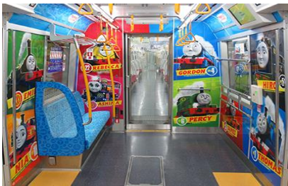
Thomas the Tank Engine

The Bureau of Transportation of the TMG has been operating trains with "Childcare Support Space" on every Toei Subway line to help passengers traveling with small children use the trains more comfortably and free from worries.