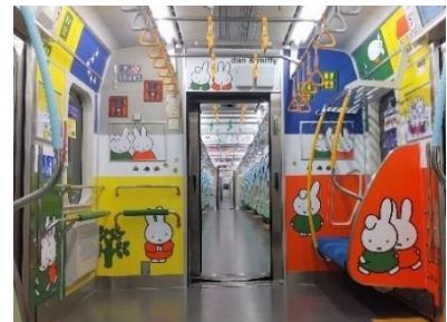
miffy and dan