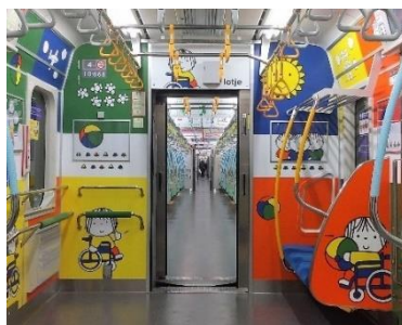
lotje © Mercis bv