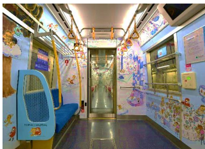
Daruma-chan and Kaminari-chan