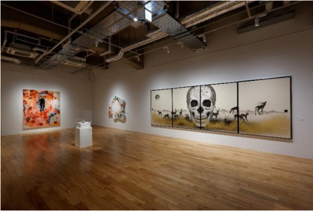
WHAT MUSEUM Exhibition View / "ART de Cha Cha Cha – Exploring the DNA of Japanese Contemporary Art –" from the Takahashi Ryutaro Collection

WHAT MUSEUM is a collectors' museum of contemporary art operated by Warehouse TERRADA. Exclusive for the participants of the program, WHAT MUSEUM will present a guided tour of its two exhibitions ("ART de Cha Cha Cha – Exploring the DNA of Japanese Contemporary Art –" from the Takahashi Ryutaro Collection and Open Creation of Art "Immerse yourself in the transitory nature" by Masayoshi NOJO), as well as ARCHI-DEPOT, its facility storing more than 600 architectural models, which architects and architectural firms have entrusted to the company, and exhibits a part of them for visitors. Also, WHAT MUSEUM will especially open until 9:00 PM during the TENNOZ ART WEEK period.