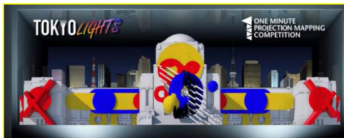
Part of a content projected

The projection mapping from April 1 (Saturday) onward will be implemented if the relevant budget for FY2023 is approved at the Tokyo Metropolitan Assembly by March 31, 2023.