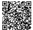
Bureau of Industrial and Labor Affairs, TMG

The projection mapping from April 1 (Saturday) onward will be implemented if the relevant budget for FY2023 is approved at the Tokyo Metropolitan Assembly by March 31, 2023.