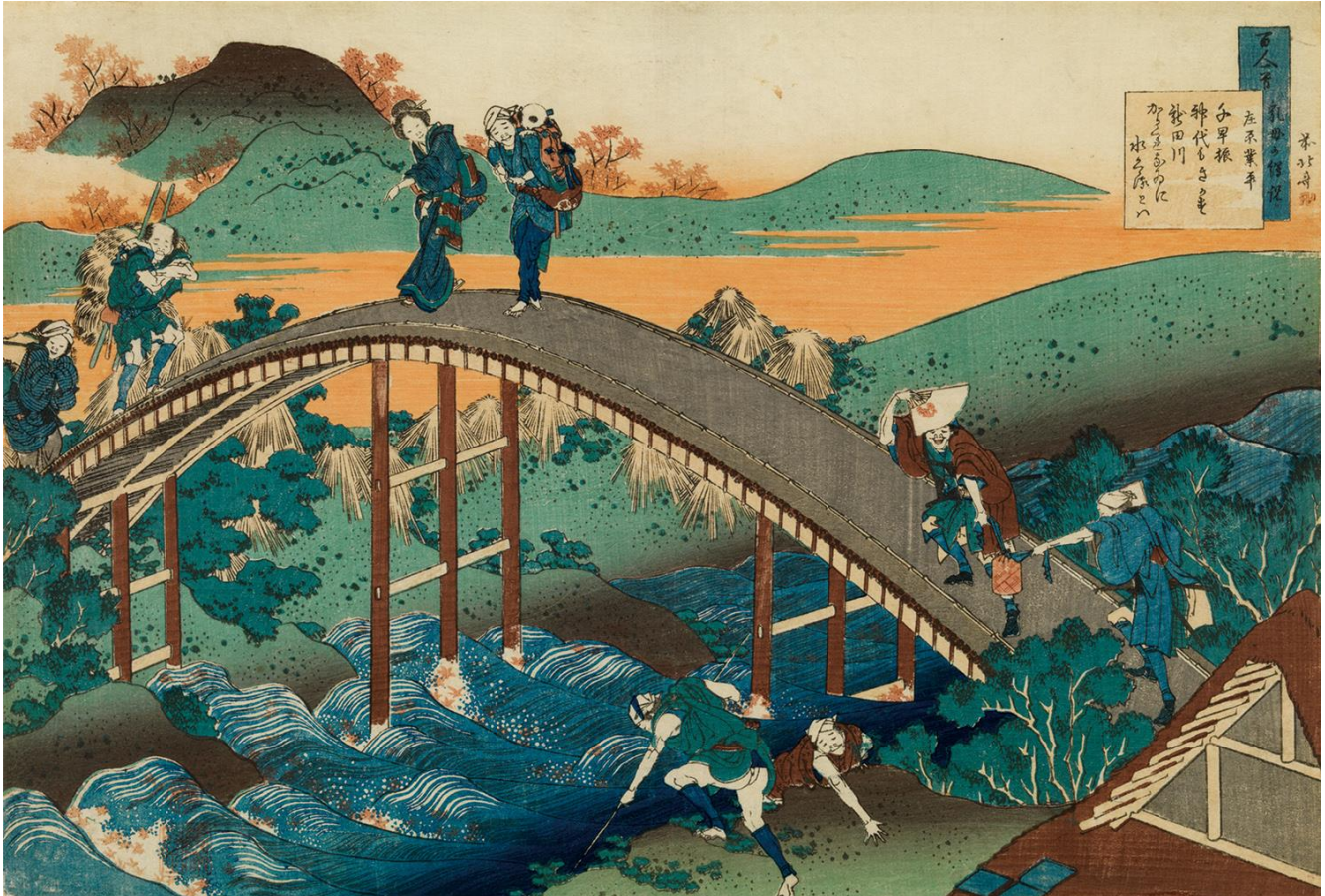
Katsushika Hokusai, Ariwara no Narihira , from the series One Hundred Poems Explained by a Nurse . The Sumida Hokusai Museum (2nd term)

The Sumida Hokusai Museum's collection of One Hundred Poems Explained by a Nurse series will be exhibited with twenty-three prints in the first and second halves of this exhibition !