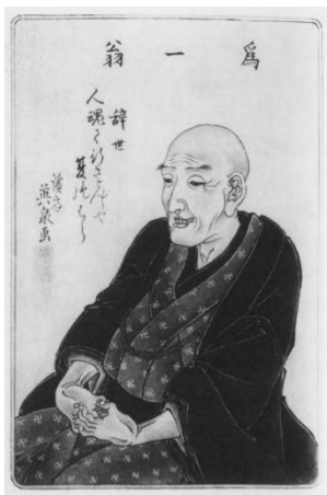
Keisai Eisen, Hokusai portrait

Japanese Ukiyo-e artist Katsushika Hokusai (1760-1849) was born in Sumida, Tokyo. It is said that Hokusai moved more than 90 times during his 90-year life, spending most of his lifetime in Sumida, and left many works depicting the scenery of Sumida, including Ryogoku Bridge, Mimeguri Shrine, and Ushijima Shrine. He vividly captured life in the Edo Period and is best known for the series “ Thirty-six Views of Mount Fuji ” which includes representative Japan’s most iconic artwork “ Under the Wave off Kanagawa ”, known internationally as The Great wave . His fascinating life and varied works spanning more than 70 years are more highly regarded today than ever, 160 years after his death. Today, he and his works are in the limelight as one of the most acclaimed artists in the world.