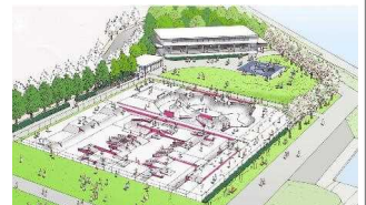
Ariake Urban Sports Park (tentative naming)