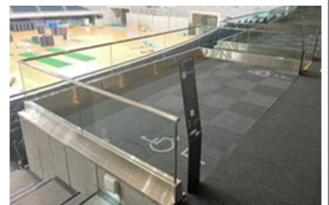
Barrier-free advanced (Tokyo Metropolitan Gymnasium)