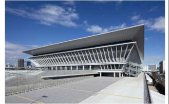
Tokyo Aquatics Centre