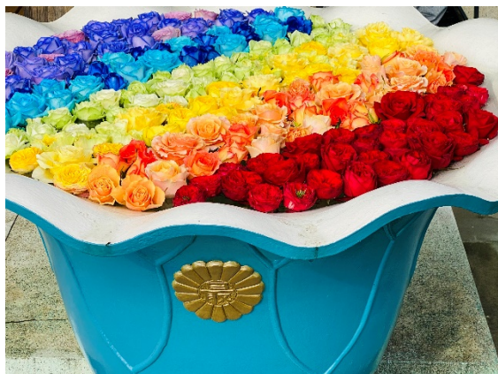
Hanachozu, popular with tourists

Kawagoe is also providing support for local children, with a food pantry initiative to supply free food collected by food banks to households raising children while facing financial difficulties. Walking around while eating is a popular tourist activity in Kawagoe's Kurazukuri no Machinami area , and many local stores have food and drink available. Extra candy and other products from stores in Kawagoe are collected and provided to local children.