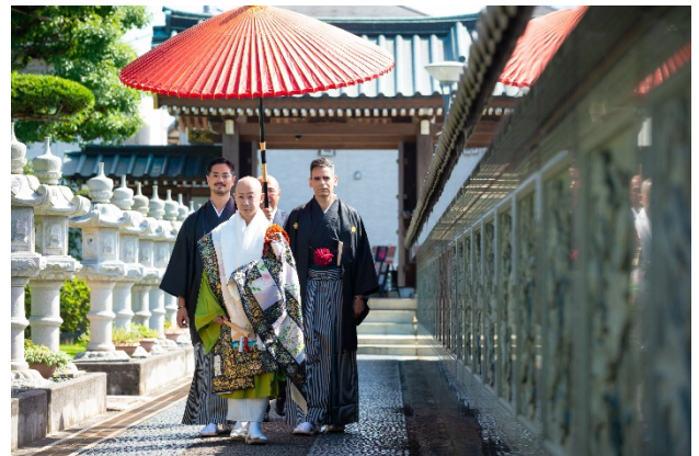
Promotional photo of LGBTQ weddings

Kawagoe, known as “Little Edo” and visited by many tourists every year, has implemented SDG initiatives by the town as a whole, such as the Kawagoe City Partnership Declaration System and renovations of kurazukuri buildings.