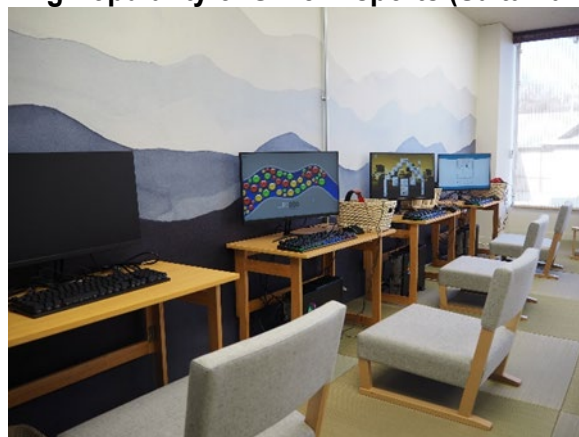
Interior of Silver Esports Gym

Saitama City has many tourist attractions, such as the Omiya Bonsai Village which is famous as a mecca for bonsai, but the city also has initiatives related to many SDGs, such as food drives to supply donated food to social welfare facilities and sharing services for bicycles and cars, and has been recognized by the Japanese government as a SDGs Future City.