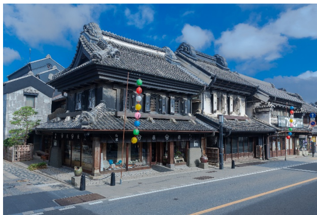
Kawagoe's Kurazukuri no Machinami