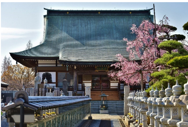
Saimyoji Temple, built in 1262 in Kamakura Period