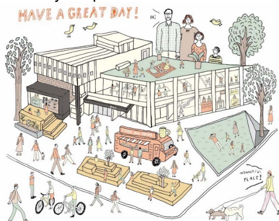
Bibli promotional image