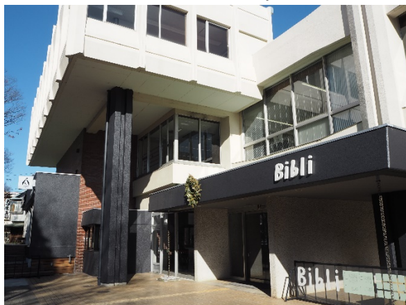
Bibli, which opened in 2021 in the renovated former Omiya Library

As Saitama City becomes a mecca for silver esports in Japan, people are watching with interest to see what silver esports activities Saitama City will promote next.