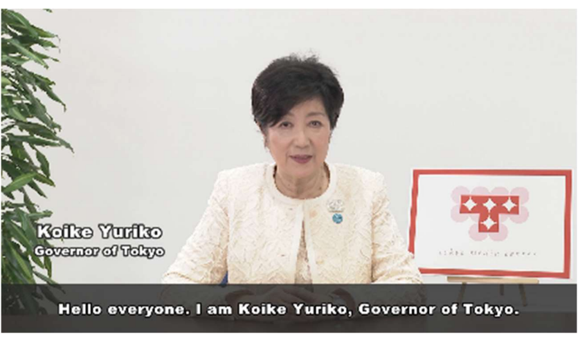
Video invitation from Koike Yuriko, Governor of Tokyo https://tokyo.mediacenter.jp/about/

With the Olympic Games just 18 days away, Tokyo Governor Koike Yuriko sent a video message to the world's media inviting them to the Tokyo Media Center (TMC) provided by the Tokyo Metropolitan Government. TMC offers services not only for members of the press coming to Tokyo but also those working from their home countries, a great opportunity to cover the Games and the City online no matter how far away. Registration is required for full use of member services. Do not miss the opportunity to receive regular full online updates about what's happening in Tokyo during the Games!