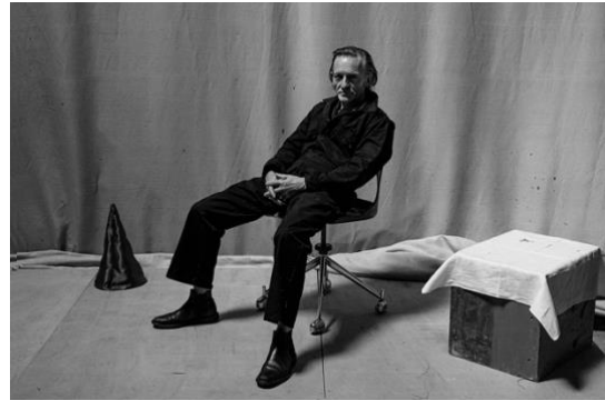
Michiel Borremans

and narrative, is very much evident in his works, which possess a singular aura that conveys the disquiet and danger lurking in the everyday, via subjects rich in anomalies and ambiguities. In recent years Borremans has also expanded his practice to include painting-derived works on video. He has been invited to participate in international exhibitions including the Biennale