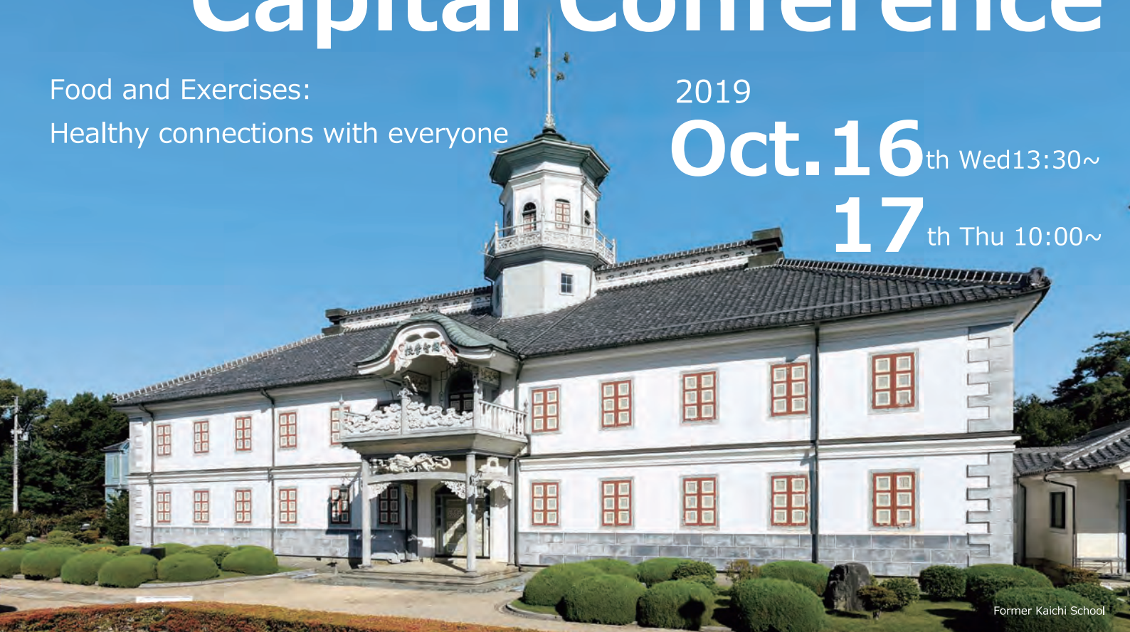
Former Kaichi School