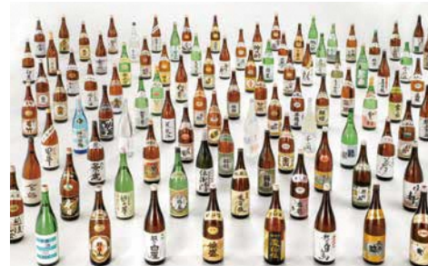
The most breweries in Japan