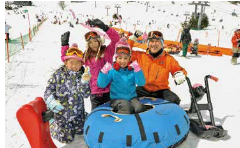
Niigata Snow Resorts

Mountains, rivers, villages, the sea; Niigata is the proud home of abundant natural scenery, and overflows with a variety of different attractions each season. Known as an area of heavy snowfall with many ski resorts, Niigata will be the location of the Alpine Skiing World Cup in February, 2020. It is also famous as one of Japan's prominent rice and sake producers.