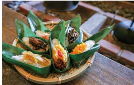
Local cuisine unique to Niigata