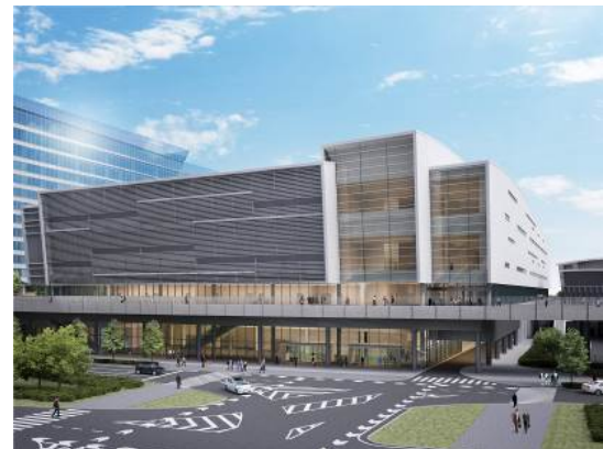
Exterior view of PACIFICO YOKOHAMA NORTH

In the field of hosting international conferences, PACIFICO Yokohama is proud of our top track record in Japan*3, and through this expansion of our business, we look forward to creating even greater economic benefits in the future.