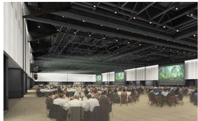
The largest multipurpose hall in Japan

(The high-rise building toward the front right is The Kahala Hotel & Resort Yokohama)