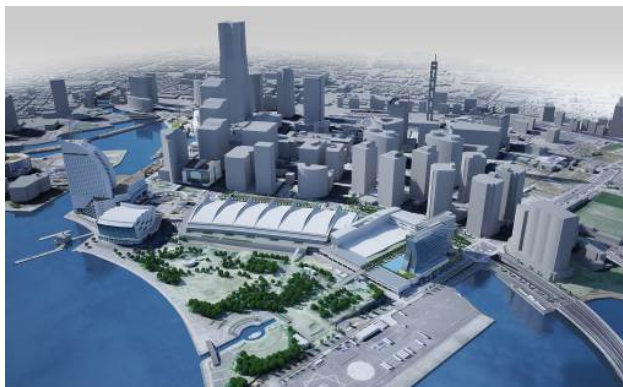
PACIFICO YOKOHAMA NORTH (right, low-rise) and the existing PACIFICO Yokohama (left)

*The popular name was decided through consultations with Yokohama City, considering features such as the convenience of integrated use with PACIFICO Yokohama.